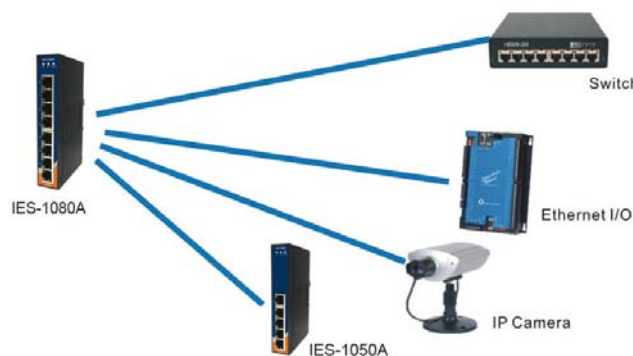
Connections of Ethernet devices

IES-1050A/1080A can be used in connecting several Ethernet devices like Ethernet I/O, IP-Camera or other Ethernet switches. In addition, there are two different power inputs at terminal block to avoid interruption caused by power down. When the primary DC power input fails, the backup power input will take over immediately to guarantee a non-stop operation.